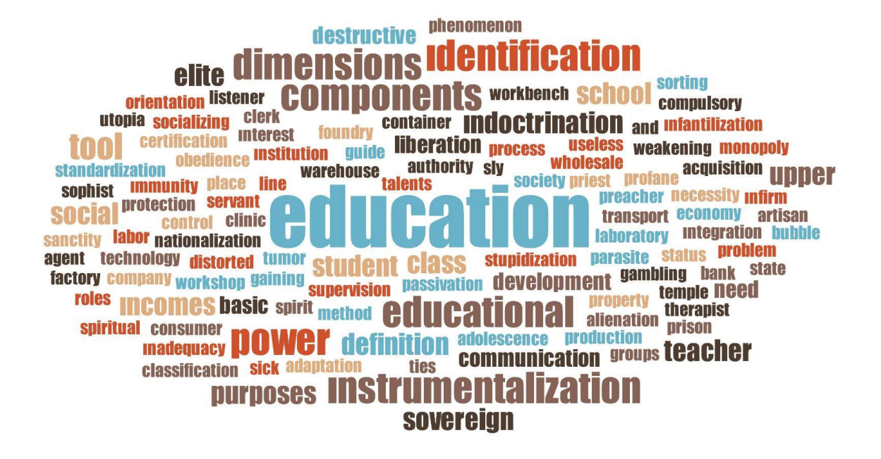
Figure 1. Word Cloud

"Educational technology consistently shows the teacher's subordinate position in taking precautions and improving behaviour." (İllich, 2019).