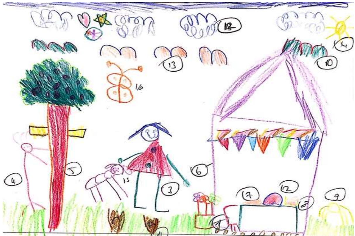
Drawing 1. An Example from Children's Drawings

Another important finding is that while the children were depicting natural events in their drawings, they depicted them in closed areas such as school ( f=2 ) or classroom ( f=1 ) to a considerably small extent. Thus, it can be thought that the generally accepted experience of school does not find much place in the school experiences of the children. In the artificial environment sub-dimension, the most frequently produced code is tent ( f=9 ). The tent is the closed area of the forest school where they receive their education. Thus, it can be thought that the children have not internalized the tent within the general definition of the school phenomenon and perceive it differently. One sample drawing is shown as Drawing 1.